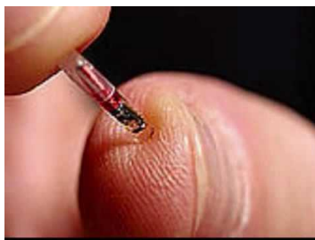
Micro Implanted Registration Chip (MIRC pronounced MARK)