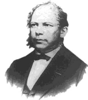
Lobegott Friedrich Constantin Von Tischendorf (1815-1874)