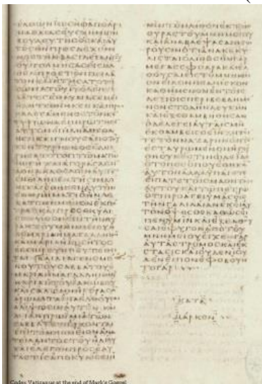
Codex Vaticanus Mark 15:43–16:8 (minus the longer ending found in the KJB.)