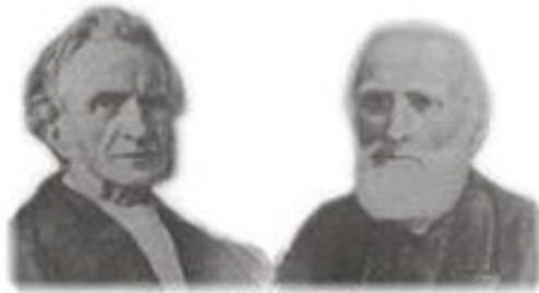
Westcott & Hort