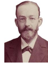
Eberhard Nestle (1851-1913)